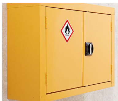
Includes free warning labels