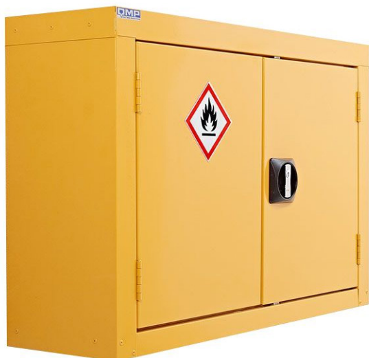
Steel Construction CoSHH Storage